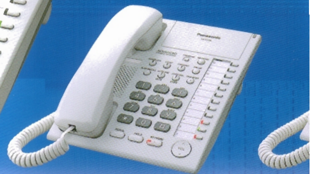
KX-T7720 Speakerphone Unit