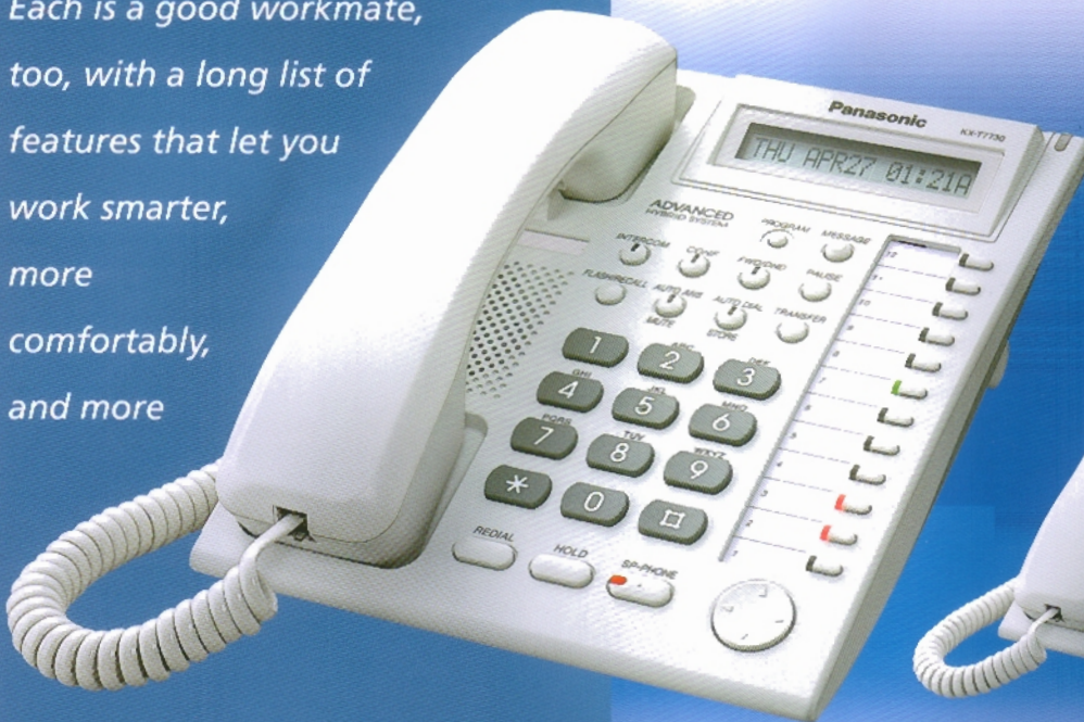
KX-T7730 Display Unit

16-Character LCD (KX-T7730) The large display has easy-to-read characters.