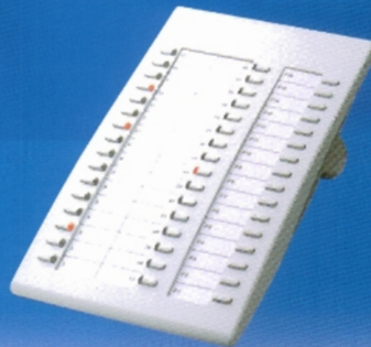
KX-T7740 DSS Console