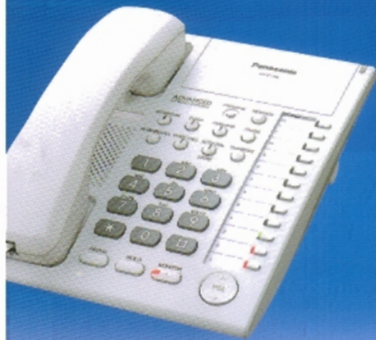
KX-T7750 Monitor Unit